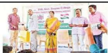
చిరాలలు సేకరిస్తున్న ధృక్పథం