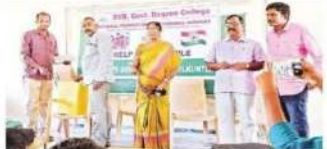
విద్యార్థులు సేవసంస్థలకు ద్రవ్యం

సాక్షి Wed, 24 November 2021 https://epaper.sakshi.com